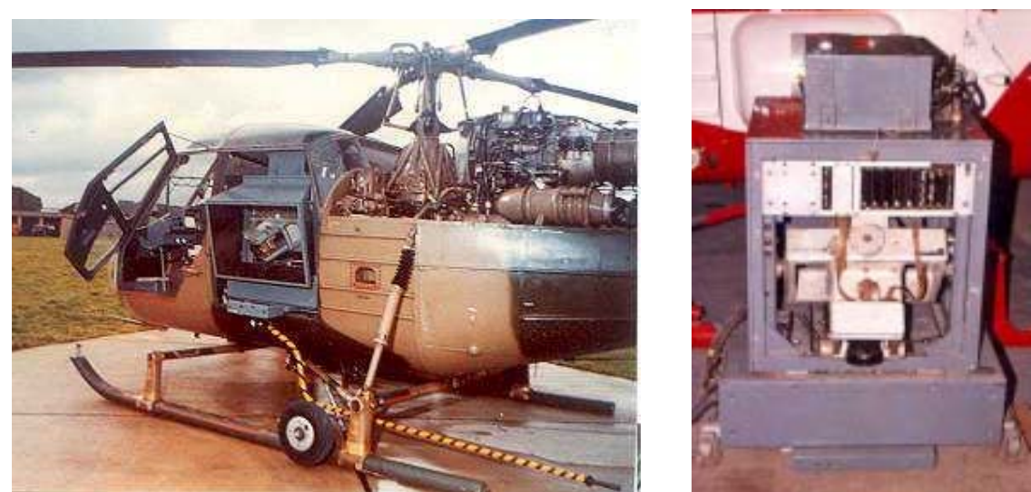
One of the original Marconi Heli-Tele units is preserved by the UK Helicopter Museum

For 1975 Heli-Tele performance was breathtaking. The early examples met or exceeded the aims of the requirement, and for many years the secrecy surrounding it was maintained. The success of Heli-Tele was primarily the capability of the camera and lens and the gyro-stabilisation. The Phillips LDK 14D featured a 25:1 zoom facility and a 1.5 times range extender that enabled the camera to zoom from 20° to only 1°. The AAC Scout helicopters were able to stand off the target area virtually unnoticed and take in every detail of the action. It was to be a decade before the true worth of the system was to dawn upon those citizens of Ulster mainly affected by its prying eye.