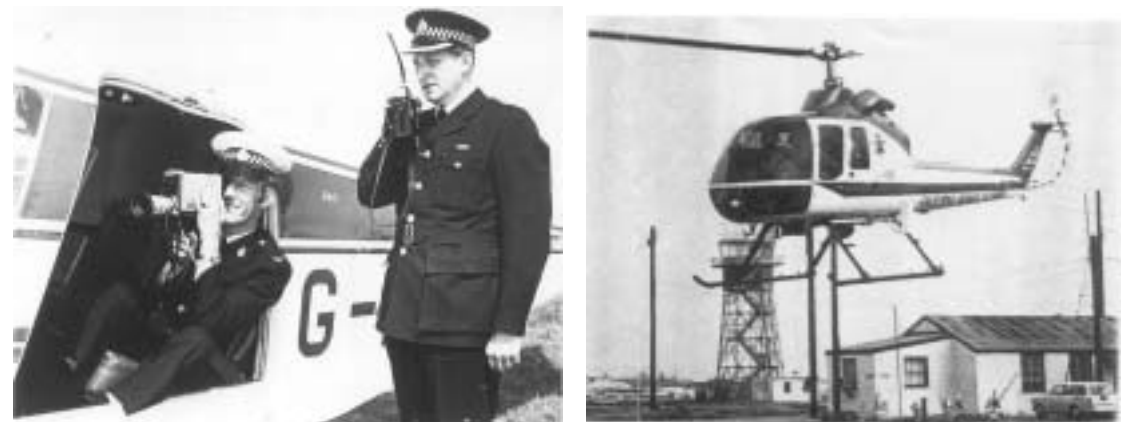
UK v USA. Similar timescale but disimilar methods. The Lancashire ground demonstration leaves some technical details – hats – to be clarified! The Californians led by example. Unfortunately the World was not watching.

The use of the single engine Piper arose out of the temporary unavailability of the AA aircraft. It provided a stable perch for the two observers, Supt. Mander and Constable Pickles. Pickles was assigned the unenviable task of operating the hand held video camera out of the rear door aperture of the light aircraft. Naturally the officer was securely strapped in, but protection from the slipstream was minimal.