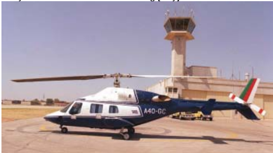
Bell Helicopter Textron

1976 The air section of the Royal Oman Police, constituted in 1975, forms operationally. Sudan forms a Police Air Wing [July].