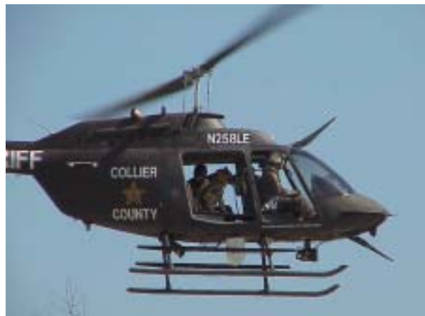
Collier CSO FL

1992 The Belgian Gendarmerie/Rijkswacht is taken out of the military service and becomes a civil police force [January].