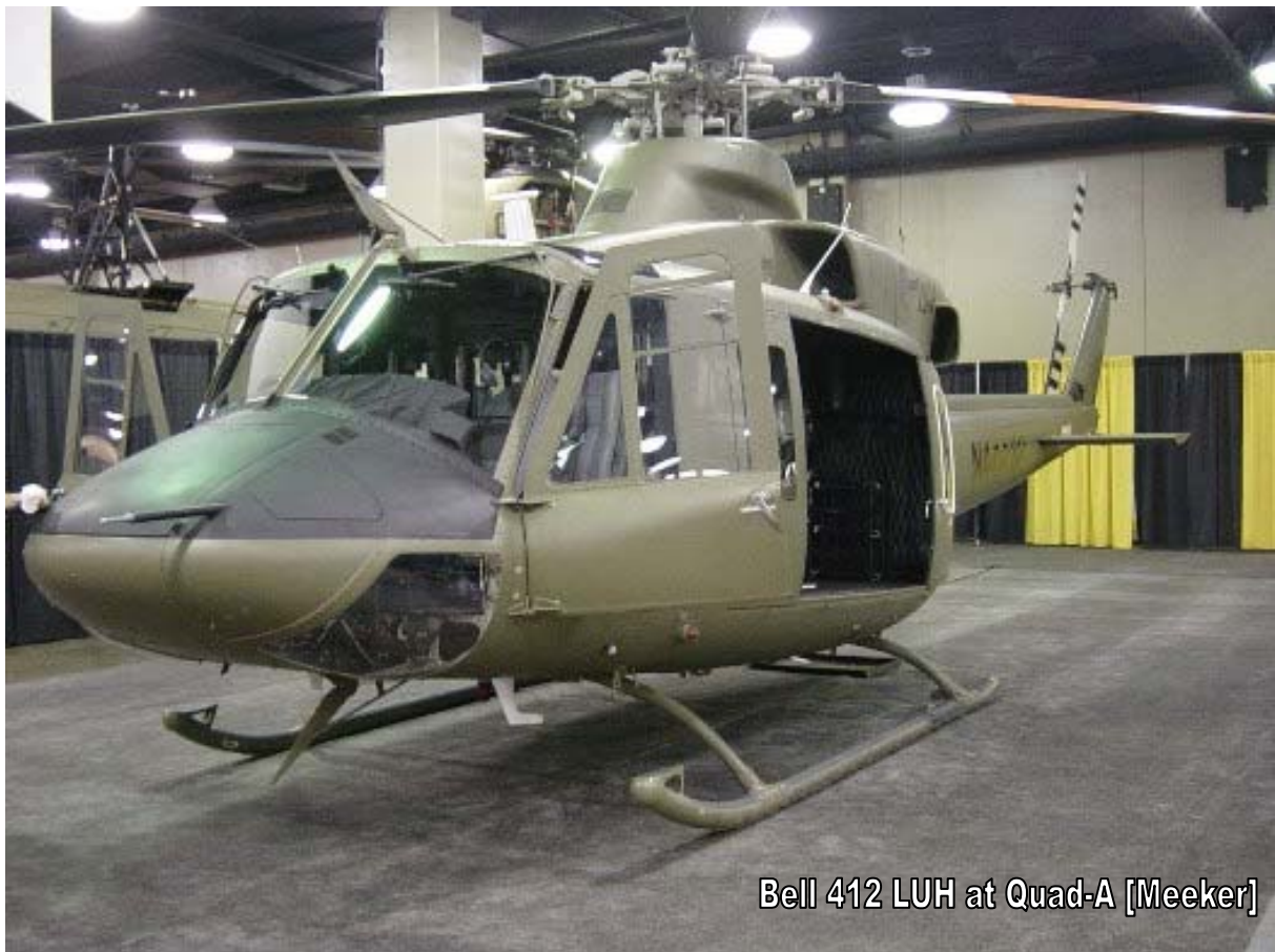
Bell 412 LUH at Quad-A