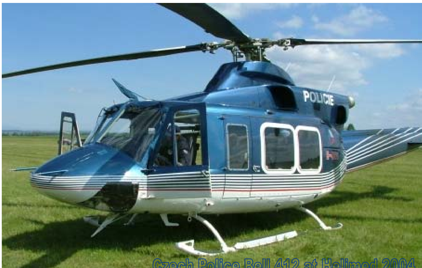
Czech Police Bell 412 at Helimed 2004

Front cover image of the former REGA Agusta A109K now serving Air Transport Europe in Eastern Europe as OM-ATE. Taken at the Helimed 2004 event in the Czech Republic. Helimed CZ 2006 takes place later this month. The Annual HEMS meeting and air show takes place at Hradec Kralove.