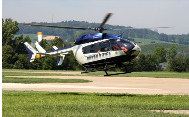
Hessen's first EC145

The first of the trio was delivered in 2002 and was the first German operator to put the EC 145 in service. The Hessen fleet are equipped with a searchlight, an external loudspeaker, a cargo hook, a roping device and have a moving map and sensor turret.