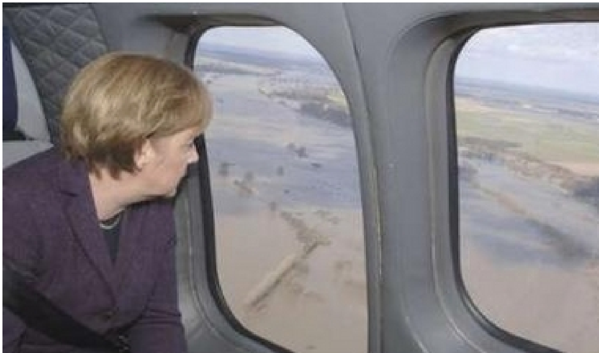
Much of central Europe has suffered from flooding in recent weeks. German Chancellor Angela Merkel watches flooded areas as she sits in a Border Guard [BGS] Puma helicopter on her way to the northern German town of Hitzacker April 9.