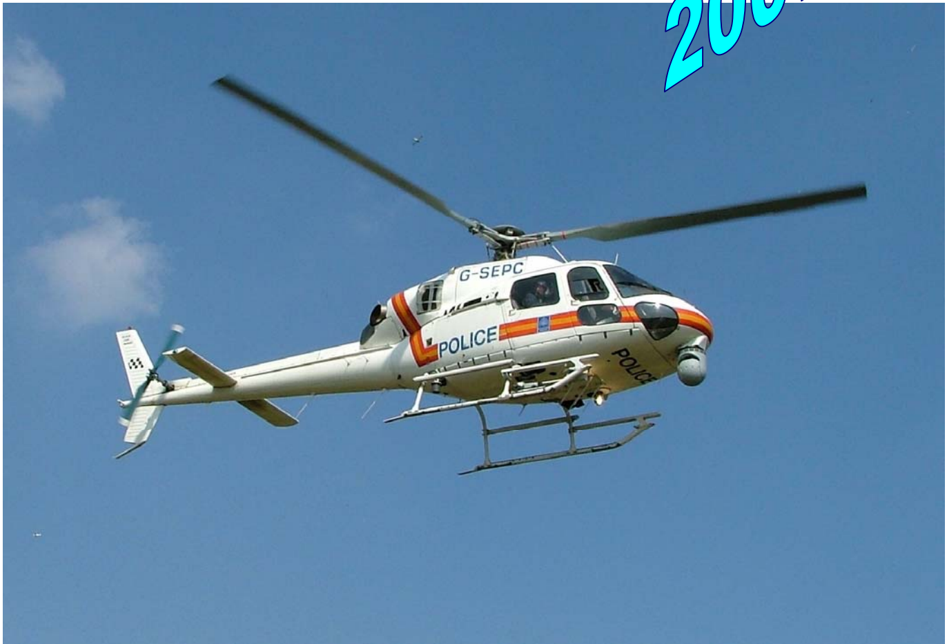
Metropolitan Police Eurocopter AS355N [PAN]