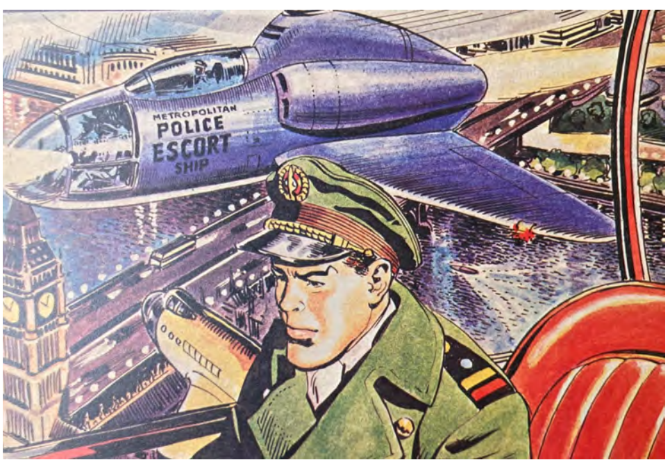
Dan Dare pilot of the future from The Eagle comic ©Frank Hampson