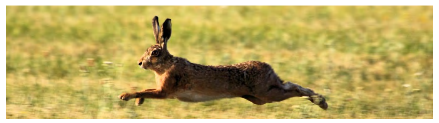
ESSEX: Incidents of hare coursing in Essex have dropped by half in the past year as word gets out that hare coursers are not welcome in the county.

In the 12 months to 31 March 2023, 180 incidents were recorded, compared with 363 for the previous 12 months – a drop of 183 or 50.4%.