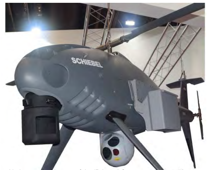
No images are known of the 'Bristow' Camcopters burgs is one that was on the manufacturers stand at the Singapore Air Show last month.

Since early January this year Bristow has had two 2019