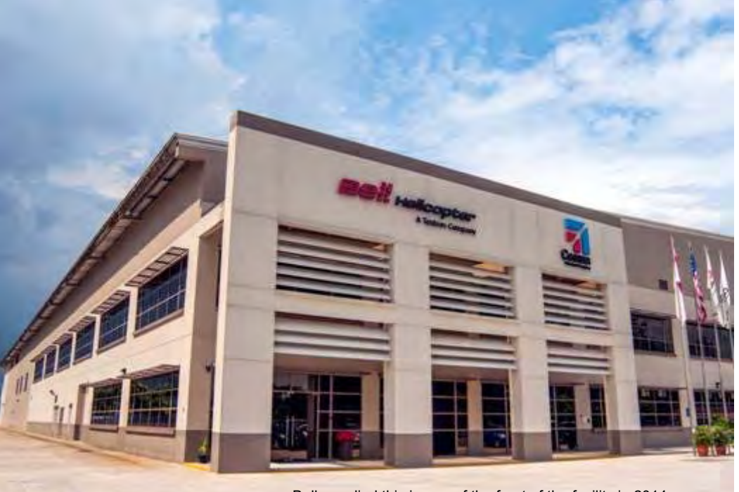
Bell supplied this image of the front of the facility in 2014.

In 2014 PAN was able to visit the new facility but at the time it was still winding up so there was little to see and understandably photography of the few incomplete rooms and hangar was declined. There was more