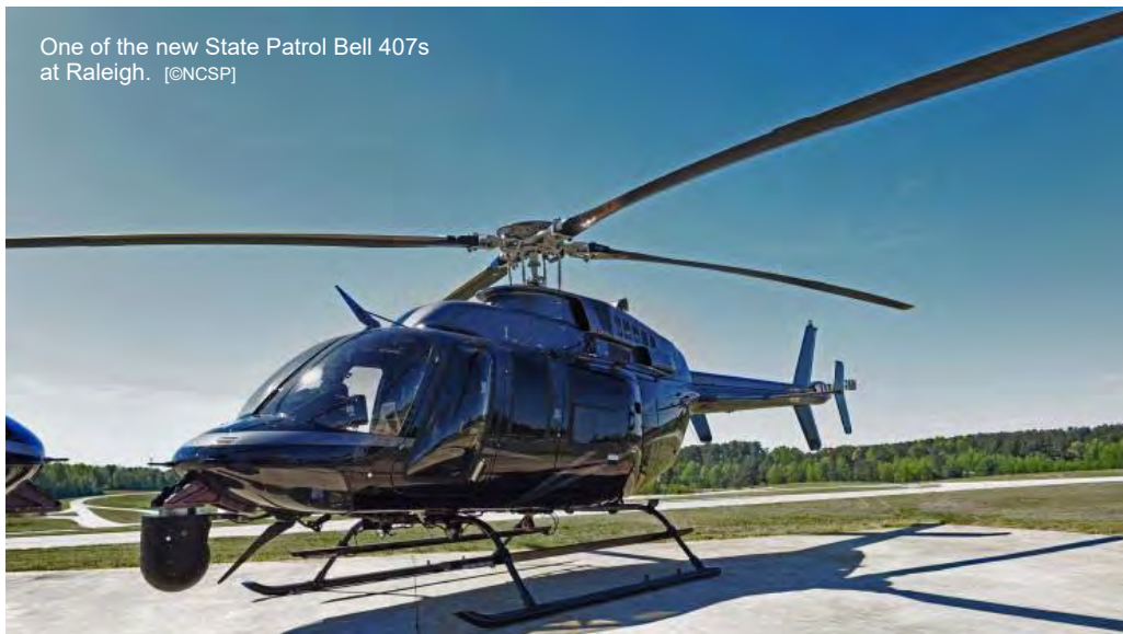
One of the new State Patrol Bell 407s at Raleigh.

The unit has mainly relied upon Bell OH58 Kiowa aircraft to provide air support services across the state for many years but acquired a single modern Bell 407 [N407NC/53840] in 2008. Last June it lost one of the 40 year old Kiowa's [N303HP] in a take-off accident at Raleigh. Two crew were injured when it crashed from an altitude of 6 feet, ended up on its side with a broken tail boom.