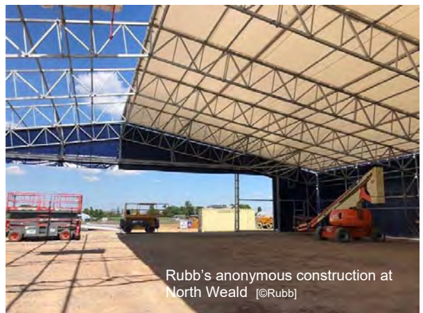
Rubb's anonymous construction at North Weald

“Additional modular buildings have been fitted to the right and rear of the building and include a number of offices and amenities. Rubb was tasked with ensuring the Rubb hangar connected effectively to the modular structures and that they were correctly positioned to allow a clear viewing area and access to the hangar.