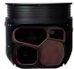
Star SAFIRE® 380-HDc

FLIR Systems continues to redefine what's possible with compact, multi-spectral surveillance systems such as the Star SAFIRE® 380-HDc and the ITAR free UltraForce 275-HD . Unmatched HD imaging in light, compact, low profile systems that don't compromise on range to ensure your airborne law enforcement mission is accomplished.