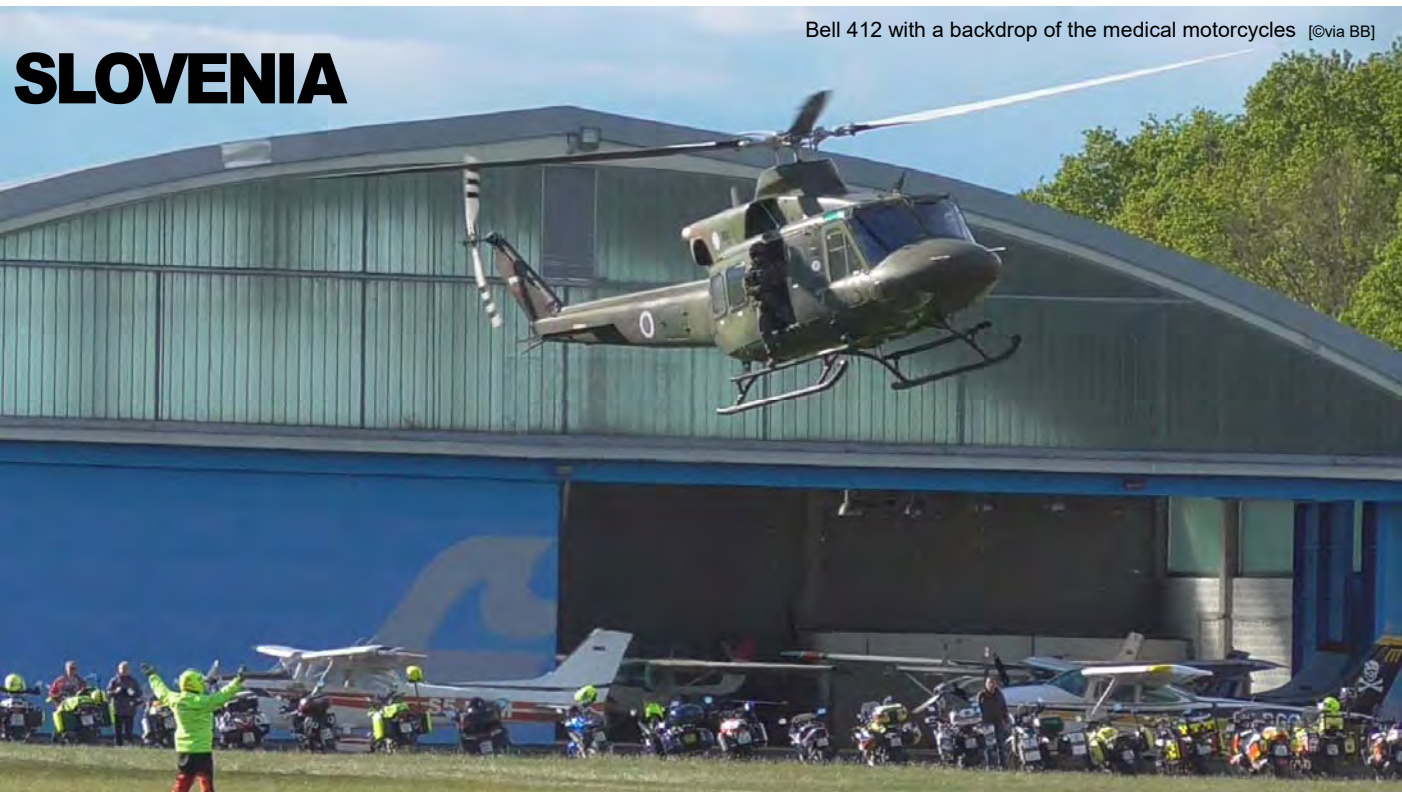
Bell 412 with a backdrop of the medical motorcycles