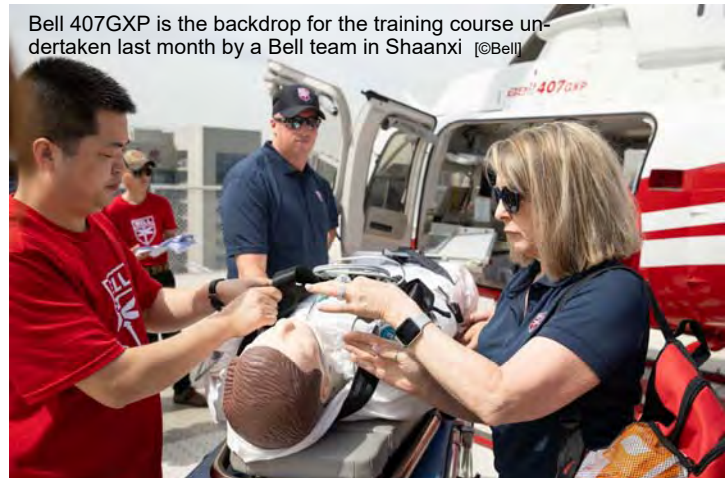
Bell 407GXP is the backdrop for the training course undertaken last month by a Bell team in Shaanxi.