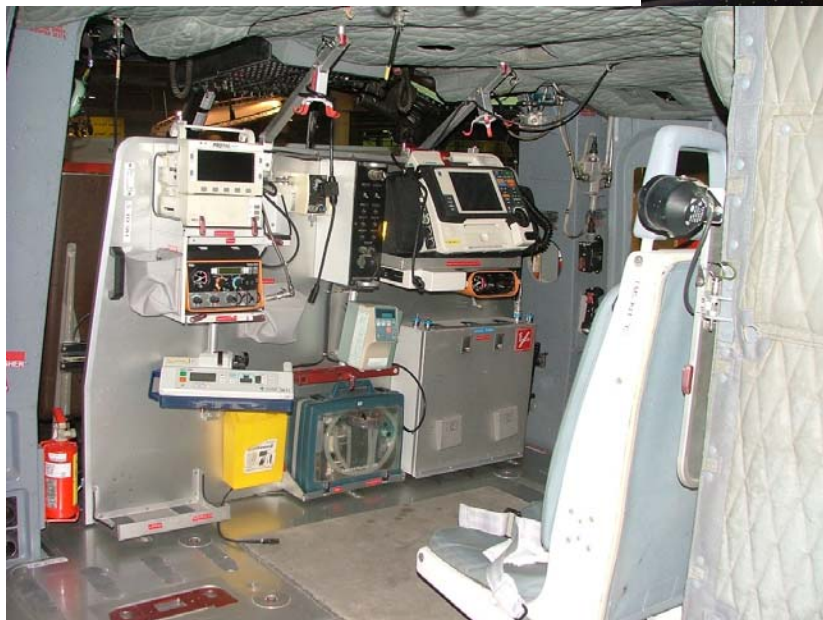
Although equipped with a FLIR turret, the primary HEMS and rescue roles undertaken by UAE crews is belied by the prominence of medical and winch equipment on the Agusta-Bell helicopters.