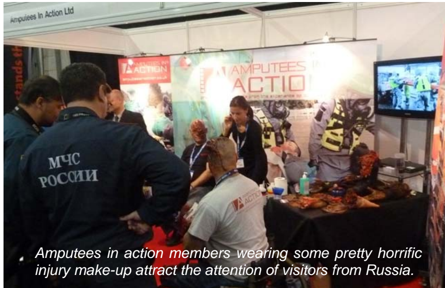
Amputees in action members wearing some pretty horrific injury make-up attract the attention of visitors from Russia.

The but in this instance is simply a question as to whether in these financially difficult times the emergency services can run to this level of realism in the training routines. Although it may tick all the right boxes in employment time and prices will make the final decision.