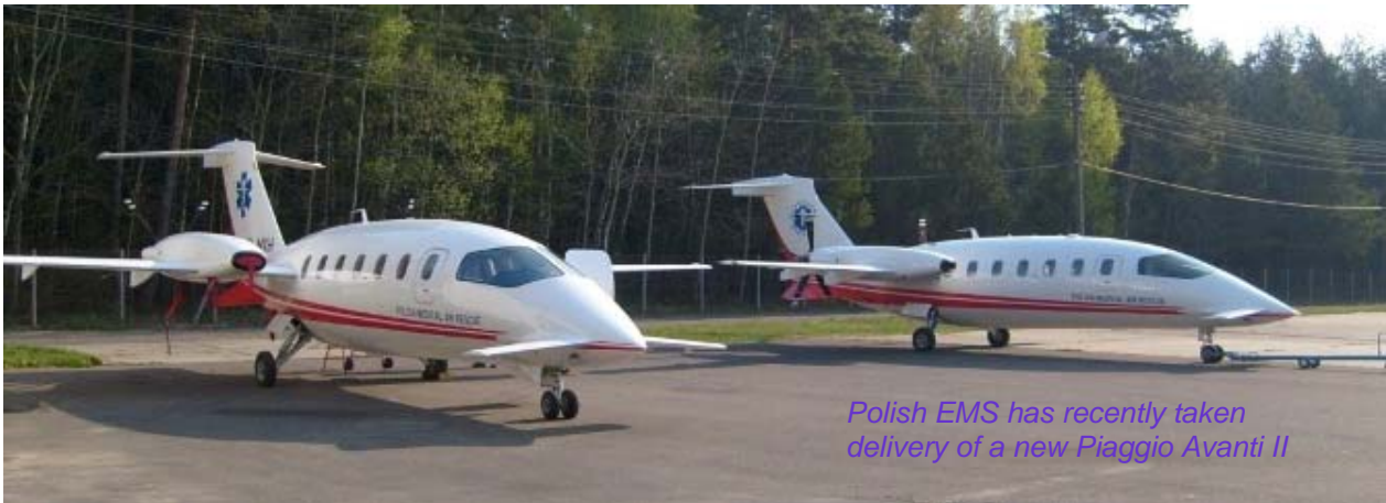
Polish EMS has recently taken delivery of a new Piaggio Avanti II

foreign-built helicopters in that country and already operates 2 EC135, 2 EC130, 2 EC120 and 1 AS350 B3.