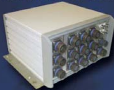
VDSU-1407 Video Management System