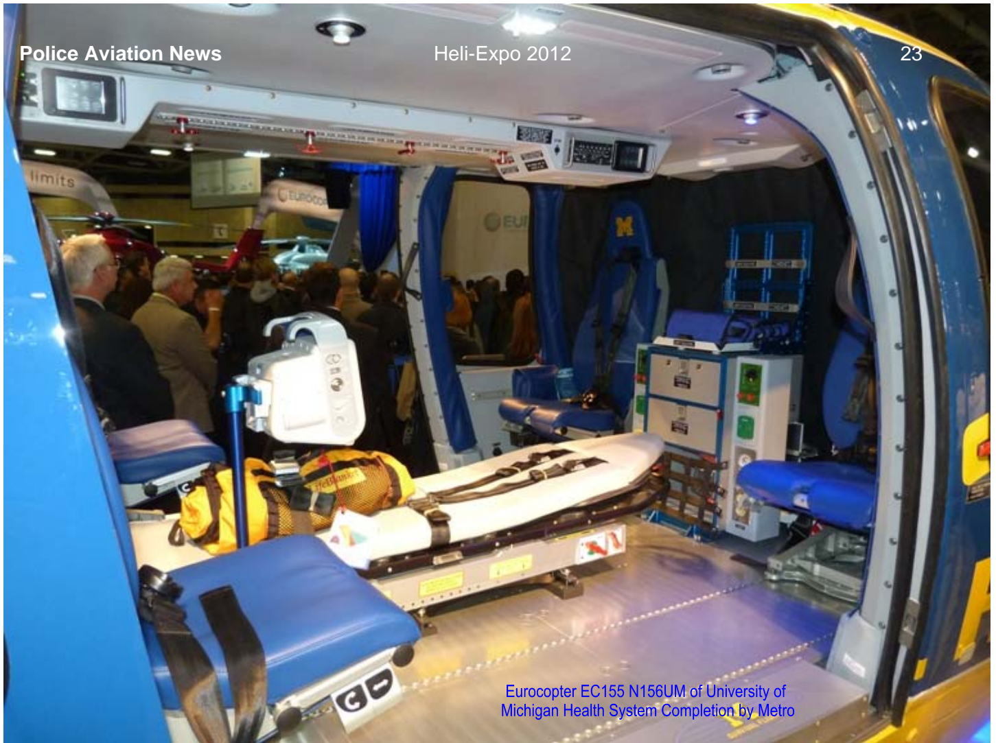
Eurocopter EC155 N156UM of University of Michigan Health System Completion by Metro