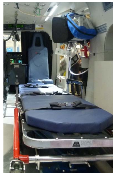
Below: Interior of the EMS fit in the rear of the Bell 429