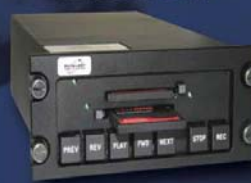
VRDV-5002 CompactFlash HD Video Recorder

CURTISS WRIGHT Controls Defense Solutions