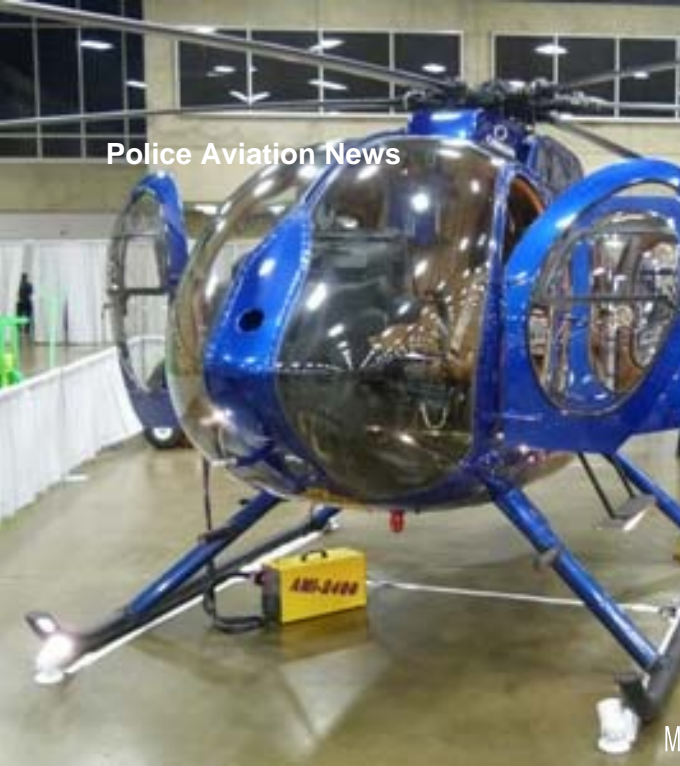
Police Aviation News