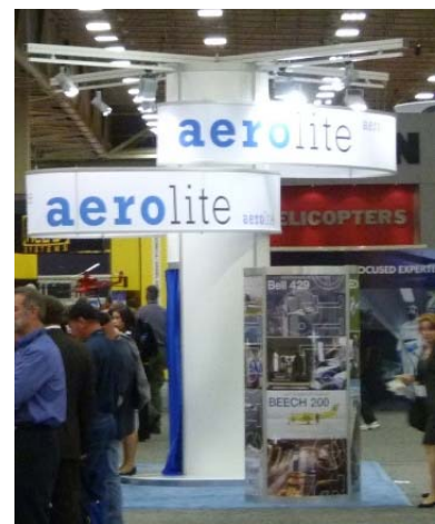
Aerolite [above] were showing images of the Ornge equipment but no actual hardware.