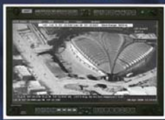
AVDU-5008 20" HD Mission Display