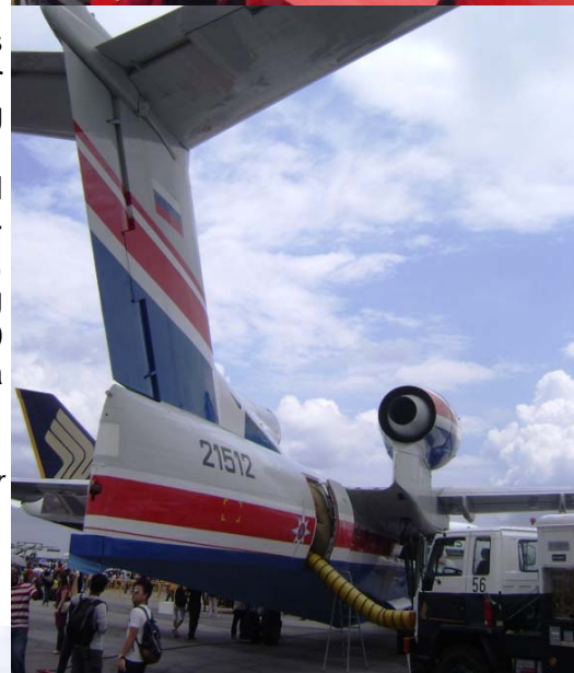
Images; Top general flight line and crowd view of the popular Singapore Air Show.