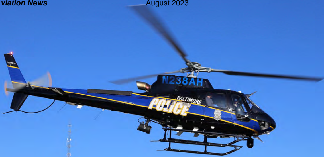
N238AH/9250 is an Airbus AS350B3/H125 first certified on 29 March 2023.