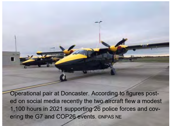
Operational pair at Doncaster. According to figures posted on social media recently the two aircraft flew a modest 1,100 hours in 2021 supporting 26 police forces and covering the G7 and COP26 events.

Deployed thirteen times throughout the severe weather, the Doncaster-based crews provided vital information to assist emergency services on the ground, including a search of every stranded vehicle on the A66, from Scotch Corner to Cumbria, to make sure there were no people stuck in their cars, or in difficulty nearby.