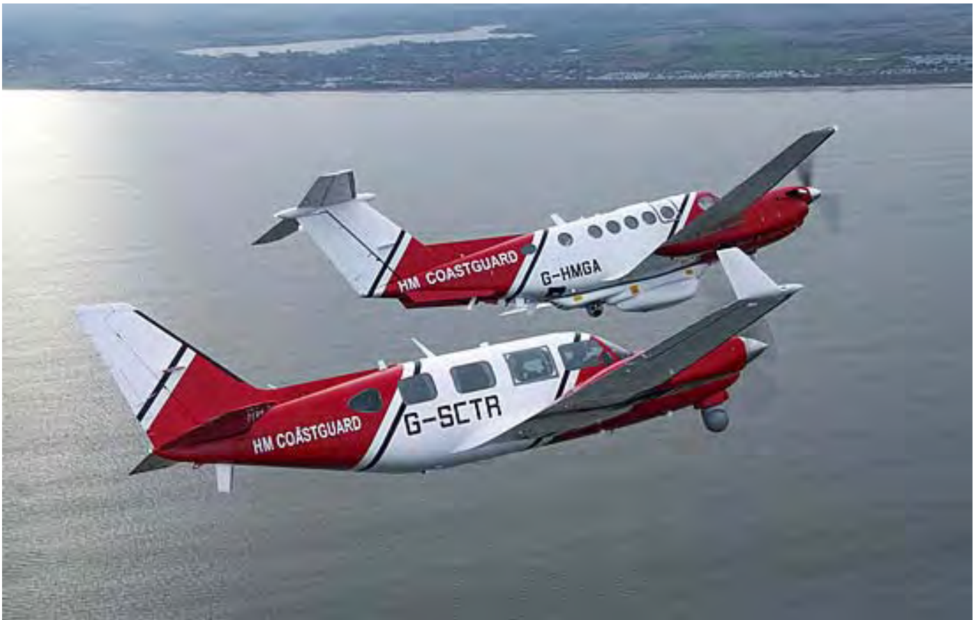
In British waters, north of the median line, Her Majesty's Coastguard patrol the English Channel with a Beechcraft King Air and Piper Navajo configured as maritime patrol aircraft.