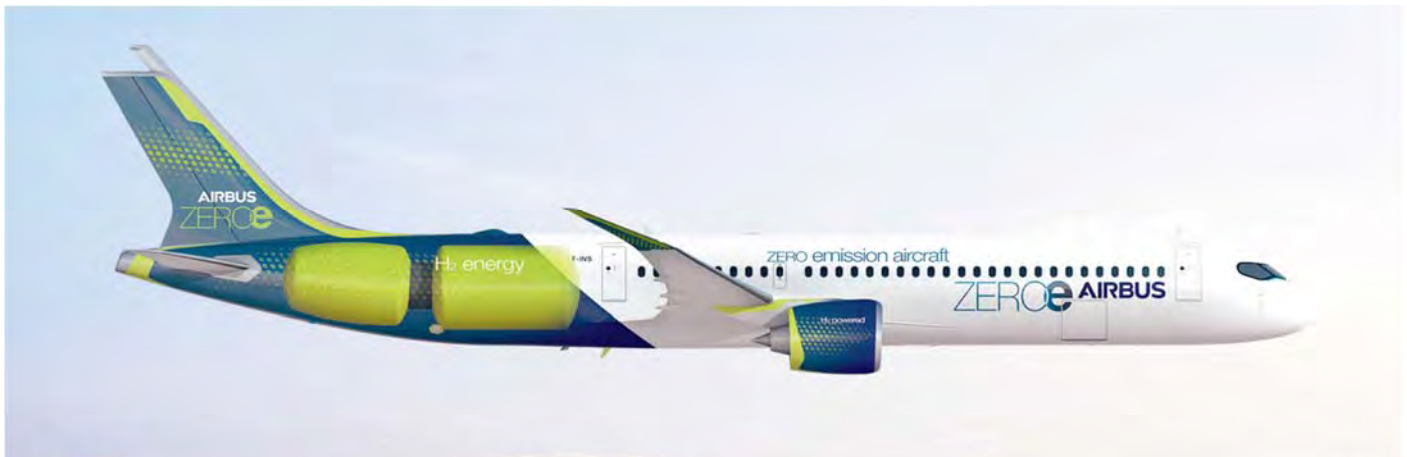
Liquid H 2 tank

Hydrogen is one of the most promising technologies to reduce aviation's climate impact. When generated from renewable energy sources, it emits zero CO2. Significantly, it delivers approximately three times the energy per unit mass of conventional jet fuel and more than 100 times that of lithium-ion batteries. This might make it suited to powering aircraft, but it has inherent issues relating to storage and as we know from previous aviation uses of the gas - safety.