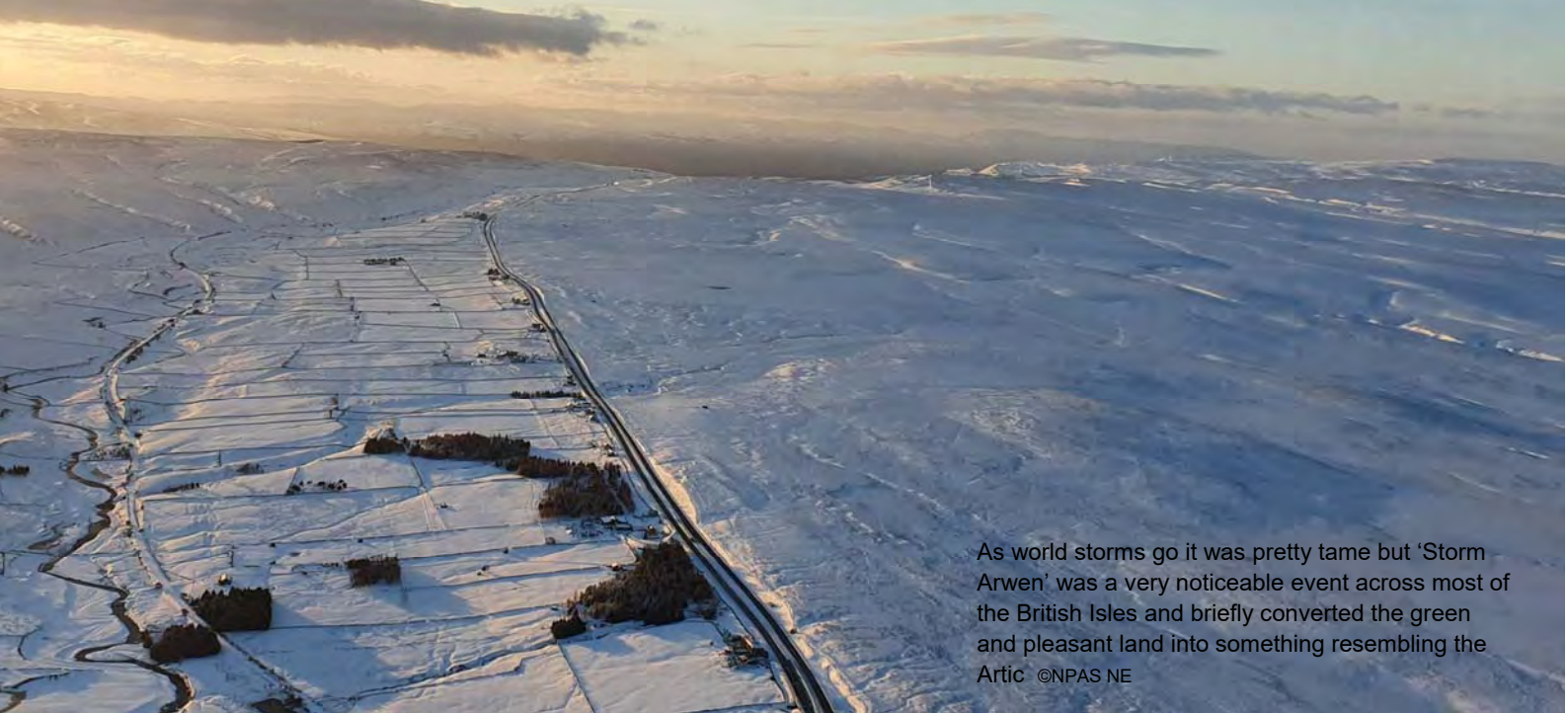
As world storms go it was pretty tame but 'Storm Arwen' was a very noticeable event across most of the British Isles and briefly converted the green and pleasant land into something resembling the Artic