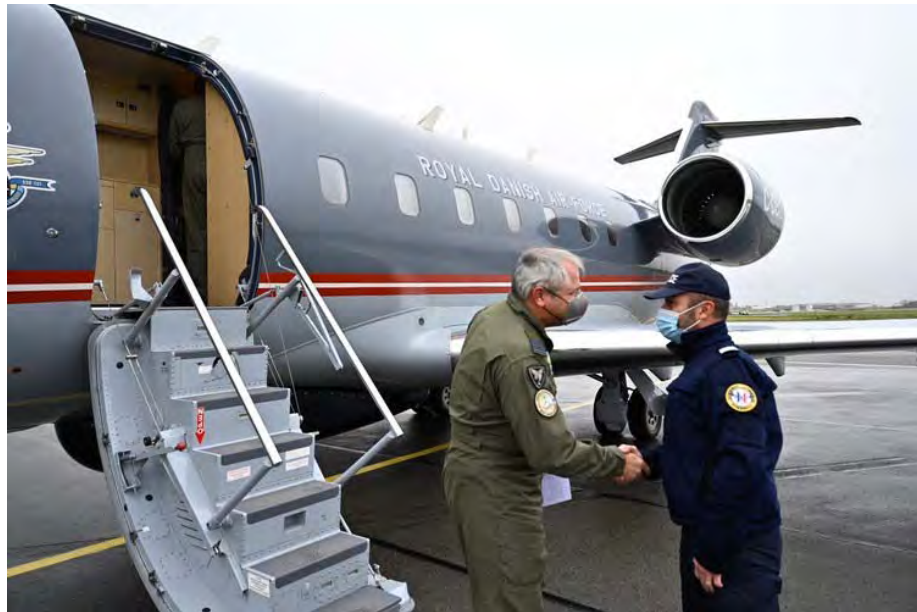
Photo opportunity, a handshake between the captain of the Danish surveillance aircraft and the local police in France. Whether the Canadair was the correct resource—when only a month ago a successful mission was demonstrated by a Diamond DA-62 aircraft remains unanswered.

The Frontex plane was provided by the Royal Danish Air Force. They operate four multirole Bombardier Challenger CL-604 aircraft, three of which are assigned to maritime reconnaissance mainly using a SLAR. Its crew is highly experienced and has already been deployed to other Frontex operations, most recently in Spain. The plane is equipped with modern sensors and radars to support border control at land and sea. During operations there will be liaison officers from the relevant authorities on board to support the crew and facilitate quick and efficient decision-making.