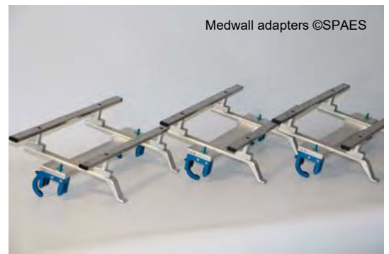
Medwall adapters

If you have a need to operate or sell and support ITAR equipment and need the knowledge to do so then an event scheduled for May 17-18, 2022, in Scottsdale, Arizona will be of interest. An intensive two-day learning experience focused on the basics of the ITAR and EAR. Seminar Level I focus on the principles of defence trade controls with practical examples, case studies, and small group discussions and provides attendees with insight into the application of export controls. Topics include State/DDTC and the Regulations, Understanding ITAR-Controlled Technical Data, How to Complete a DSP-5, Licensing Non-U.S. Persons, Utilising ITAR Exemptions, Recordkeeping, and Compliance in the Age of Export Reform.