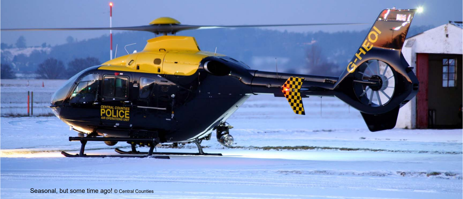
Seasonal, but some time ago!

for further promotion to ranks which included Commander, Assistant Chief Constable or even Chief Constable. Failure to pass the PNAC course prevented him from aspiring to those ranks. Was being promoted to lead a national organisation, such as NPAS, the opportunity for him to show the 'powers to be' that he did have the ability and potential to have risen higher and exhibited an 'I'll show them what they've missed' attitude? A key question for me to ask would be: