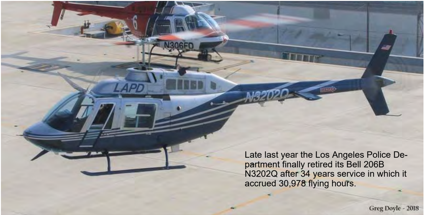
Late last year the Los Angeles Police Department finally retired its Bell 206B N3202Q after 34 years service in which it accrued 30,978 flying hours.

FH1100 helicopters were added to the fleet in 1970. The Department established an official Aviation Unit in 1984, which was the same year the Virginia General Assembly authorised funding for the creation of the Med-Flight programme.