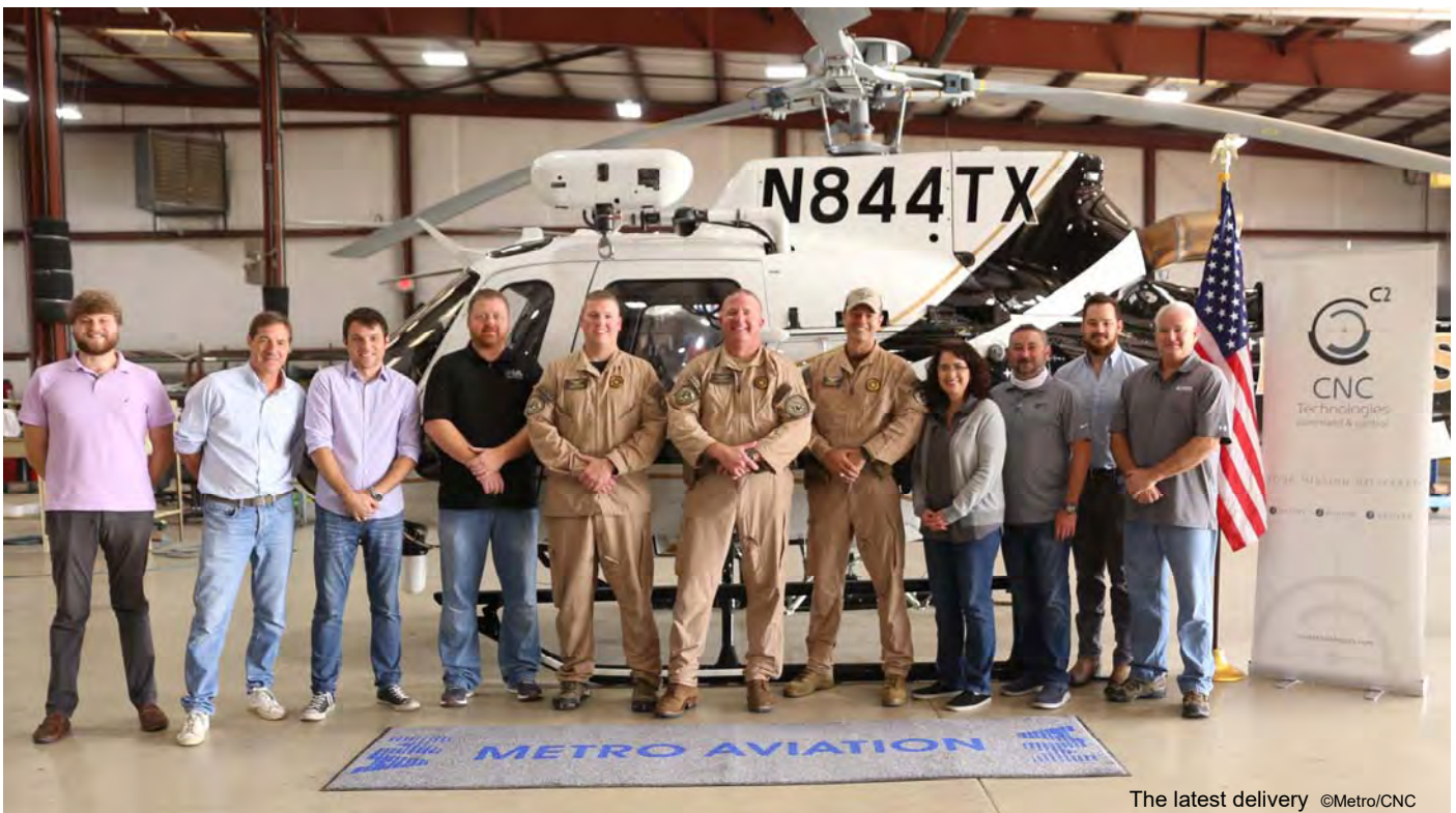
The latest delivery

The airframe c/n 54322 has been N402PD from 14 August 2020 and came from Nevada-based Battle Born Munitions Inc., based in Reno.