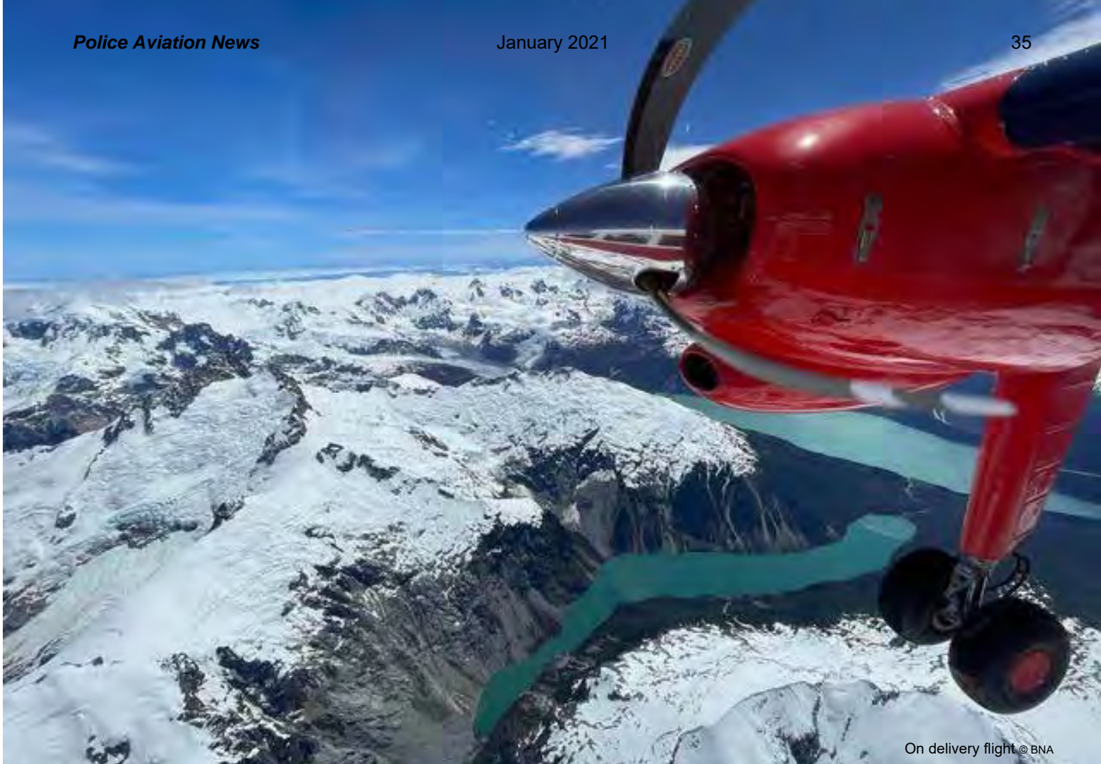
On delivery flight

In early December 2020 Britten-Norman delivered the first of two brand new BN2B-26 Islander aircraft to the Falkland Islands Government Aviation Service (FIGAS). The Islander's ability to operate with ease as a high-frequency, short-sector, passenger and freight aircraft has made it ideal for hopping around the Falkland Islands' dramatic landscape. The second Islander is scheduled for delivery in 2021.