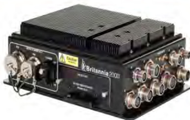
CAMC Mission Computer