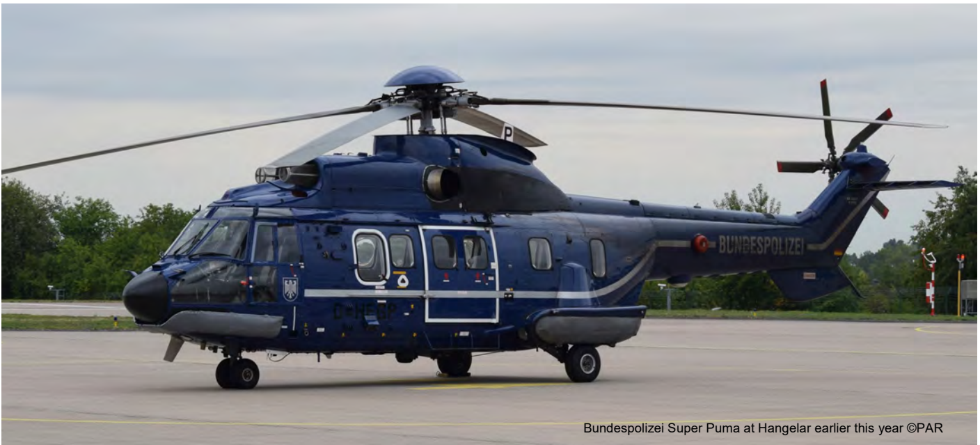
Bundespolizei Super Puma at Hangelar earlier this year

Avionics innovator and digital technology provider Becker Avionics has received STC approval for the Company's BXT6513 ADS-B transponder, designed specifically for the Special Mission & Law Enforcement ADS-B retrofit market.