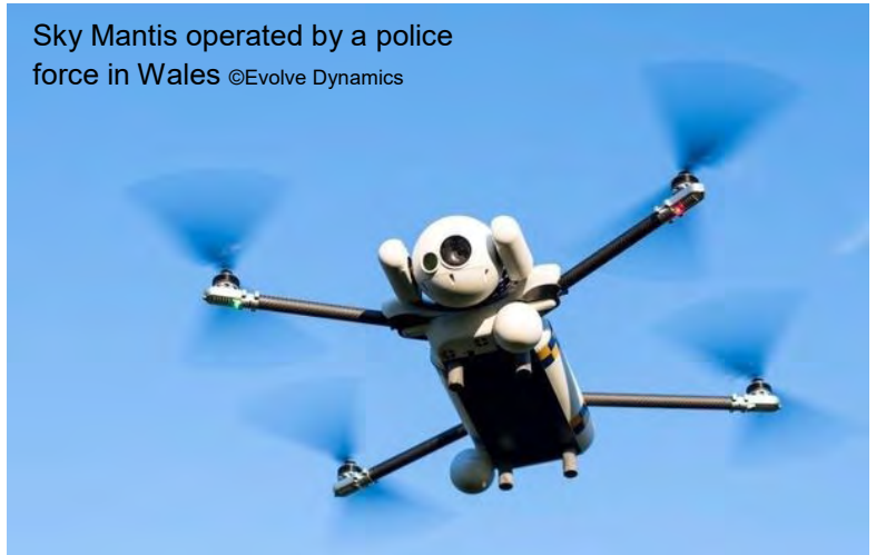
Sky Mantis operated by a police force in Wales

The system can utilise a 24 hour flight capability by using a cable that can be detached in flight and still able to offer a further 30 minutes of free flight. Www.evolvedynamics.com