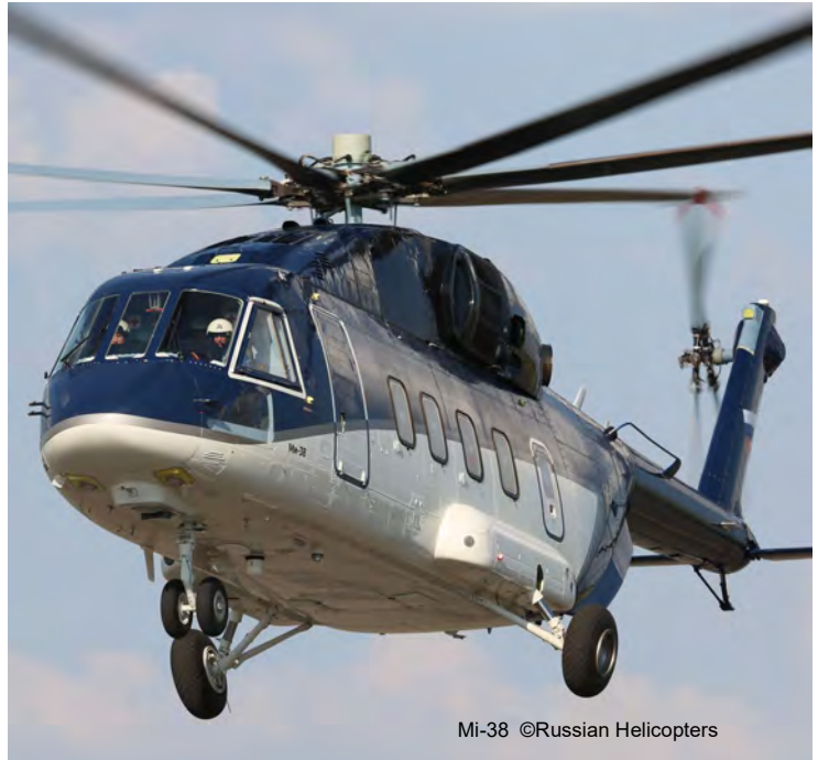
Mi-38

Russian Helicopters and Pratt & Whitney have worked together for many years on the Ansat helicopter engine and have delivered more than 70 rotorcraft that currently operate in Russia and are entering the international market.