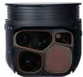
Star SAFIRE ® 380-HDc

FLIR Systems continues to redefine what's possible with compact, multi-spectral surveillance systems such as the Star SAFIRE ™ 380HDc and the ITAR free UltraForce 275. Unmatched HD imaging in light, compact, low profile systems that don't compromise on range to ensure your airborne law enforcement mission is accomplished.