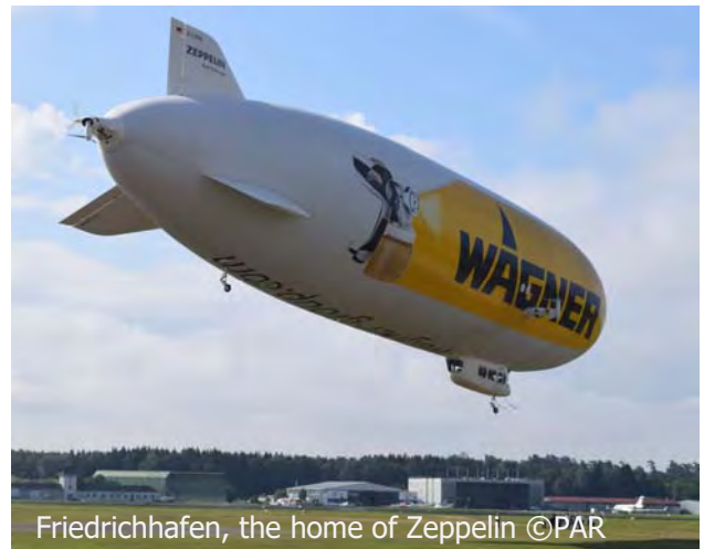
Friedrichshafen, the home of Zeppelin

In the West Foyer everything revolves around drones. AERODrones provides a unique combination of high-end exhibition and expert symposium, making it attractive to a broad range of professionals.