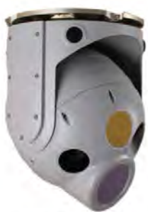
UltraForce ® 275