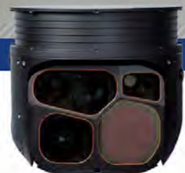
Star SAFIRE™ 380-HDc

FLIR Systems continues to redefine what's possible with the new Star SAFIRE™ 380HDc. Unmatched multi-spectral HD imaging in a light, compact, low profile system designed for your Law Enforcement mission.