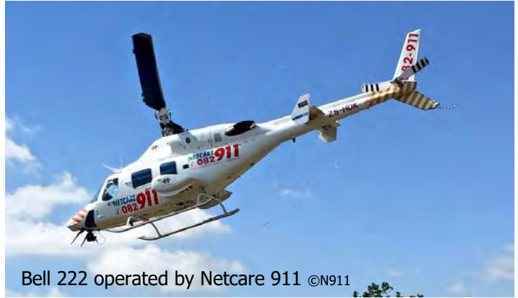
Bell 222 operated by Netcare 911