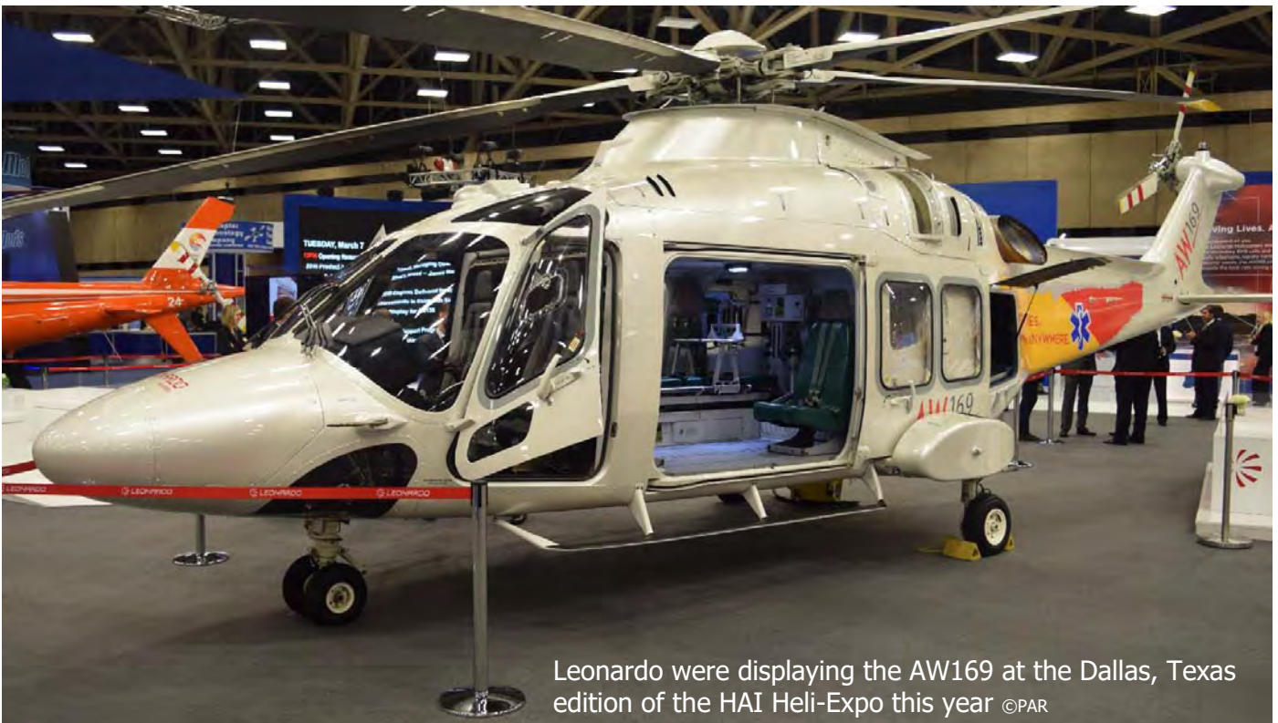
Leonardo were displaying the AW169 at the Dallas, Texas edition of the HAI Heli-Expo this year

Travis Co STAR Flight—the Texas 24/7 aerial emergency medical service with medical transport, swift-water rescue, search and rescue, high-angle rescue, fire suppression/aerial reconnaissance and law safety assistance is to give up its H145 helicopters for a fleet of new AW169 from next year, with deliveries expected to begin in October 2018.