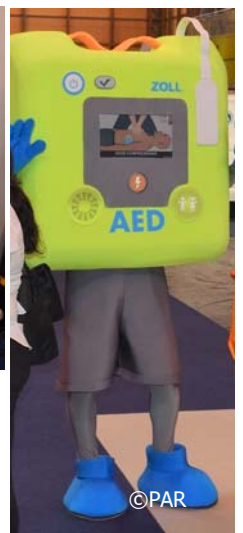
Scenes from the show. PVL have featured a few times in recent editions of PAN as a PAVCon attendee. The UAS is an over water type used in Northern Ireland by CAP. The chap on the end seems to be a relative of Sponge Bob extolling the fun side of carrying a ZOLL AED defibrillator. There must be a fun side I guess.

7-9 November 2016 Dubai Helishow 2016. The Domus Group is presenting the 7th Edition of the Dubai Helishow 2016. It will be at The Grand Stand, Meydan Hotel, Meydan Racecourse, Dubai – United Arab Emirates. www.dubaihelishow.com Dubai Helishow represents a unique opportunity for the International Helicopter community to showcase their products, services and technologies covering the Commercial, Civil and Military Helicopter including sub sectors like Air Medical Rescue & Military and Homeland Security. The exhibition will incorporate hall exhibits and outdoor static displays and two sub-events Air Medical & Rescue sector of the show and a Military & Homeland Security event with the inclusion of Unmanned Ground Vehicles (UGVs), Unmanned Surface Vehicles (USV), Unmanned Aerial Vehicles (UAVs) alongside Armoured Vehicles and other products and services aimed at protecting a Nation's citizens from external or internal threats.