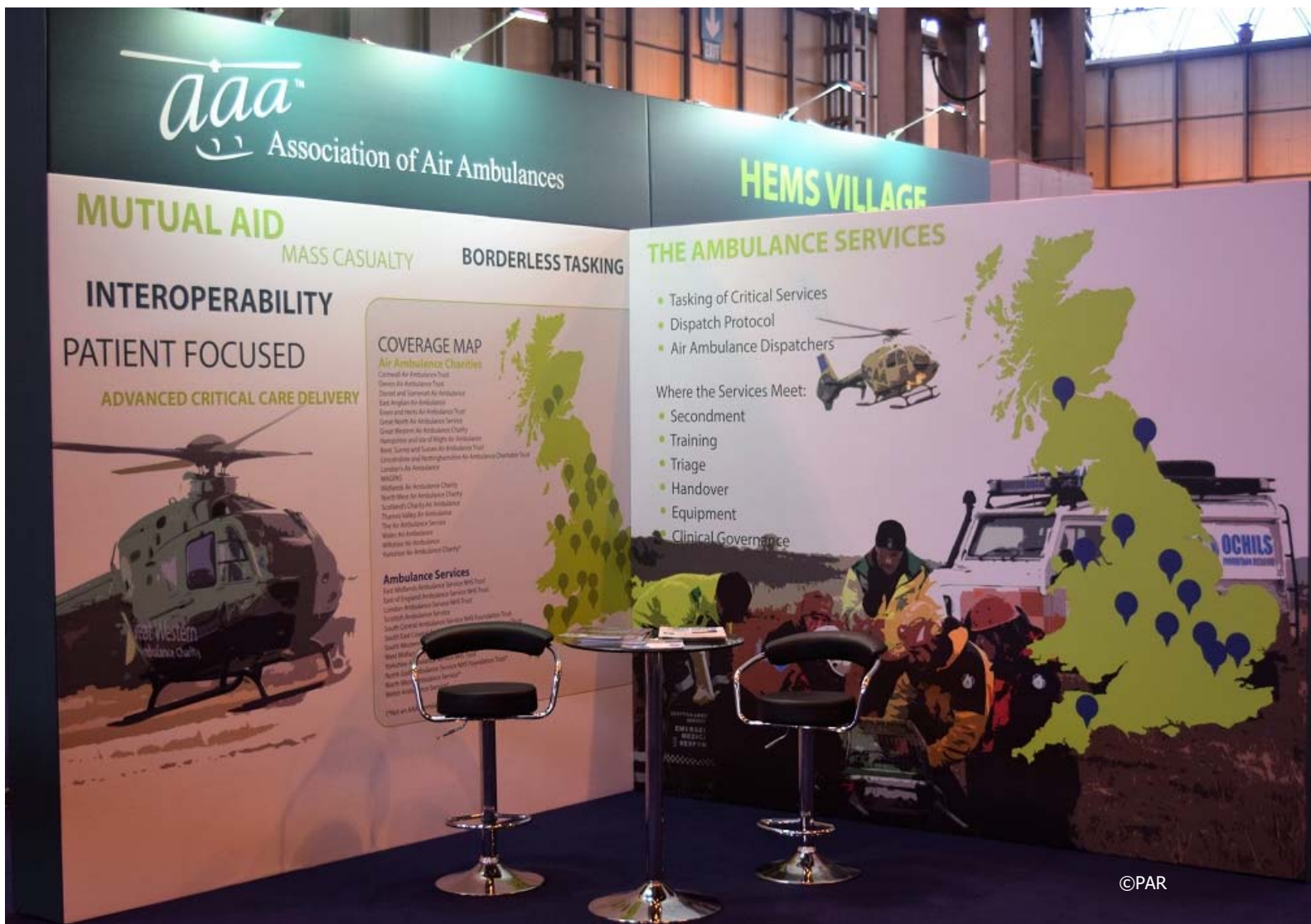
The new air ambulance centre piece operated by the Association of Air Ambulances [AAA] had its first airing at the ESS 2016