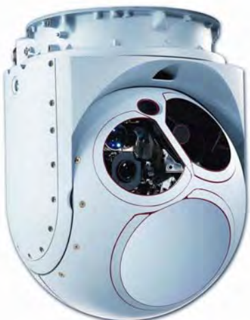
File image of MX15 EO/IR

The remedy for other nations has been to design their own cameras – something they have been doing quite successfully for well over forty years – to maintain their understanding of the technology. Often there have been instances where the camera casing has been the only difference, each player making use components sourced from the same common manufacturer and again potentially falling foul of ITAR.