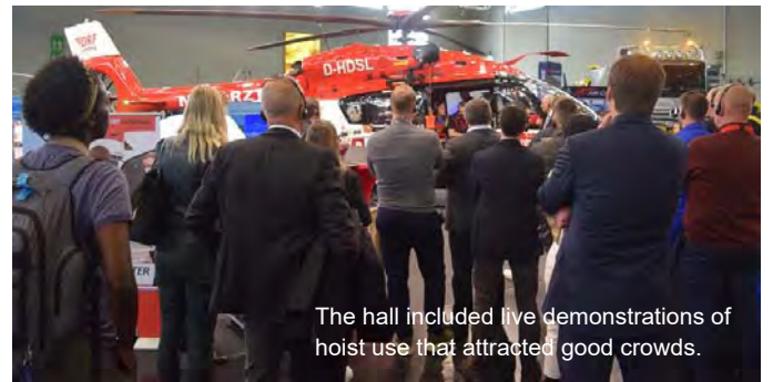
The hall included live demonstrations of hoist use that attracted good crowds.