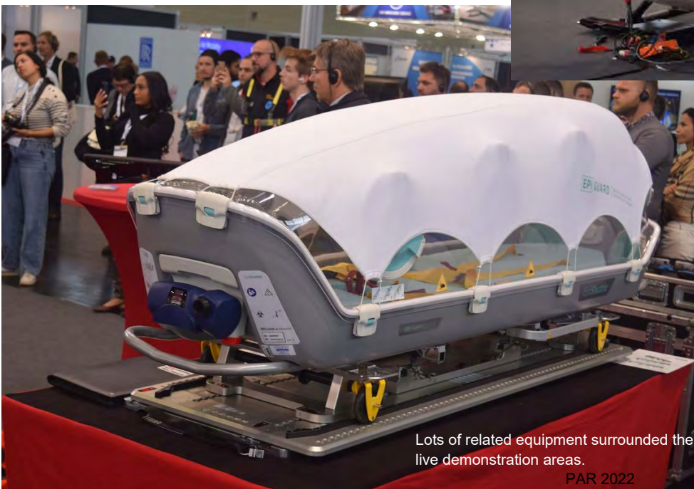
Lots of related equipment surrounded the live demonstration areas.