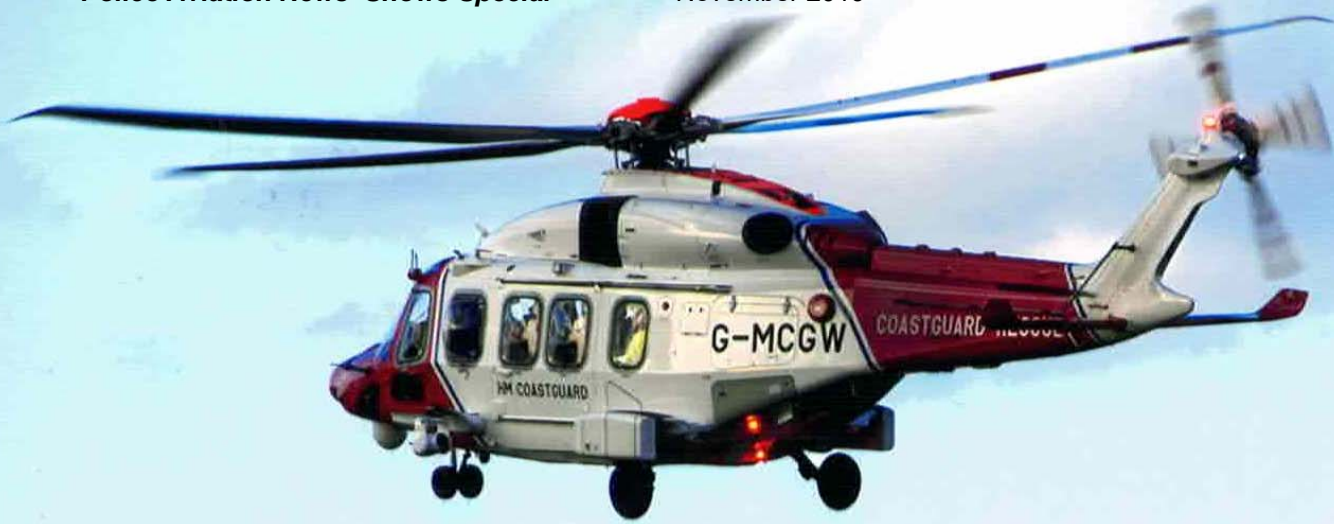
Bristow operated Leonardo AW189 of the UK Coast Guard departs from Farnborough

Traditionally Police Aviation News produces certain Special Editions throughout the year and for most of its existence PAN has undertaken to include a special report on Helitech and a few paragraphs in the standard edition on the Commercial UAV Show in London.