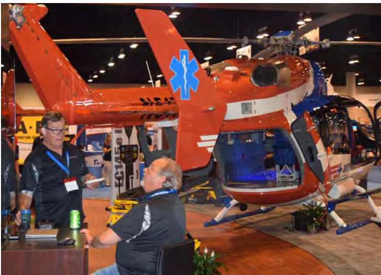
Next to Airbus was Metro with one of their EC145s for the HEMS market. During the show it was announced that Metro had ordered some of the new Kopter SH.09s for HEMS use. Kopter were not present at the show.