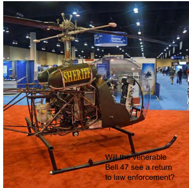
Will the venerable Bell 47 see a return to law enforcement?

These awards were not all confined to the USA, three Australian operators in the State of Victoria laid claim to the National Advancement Service Award for championing NVGs outside America.