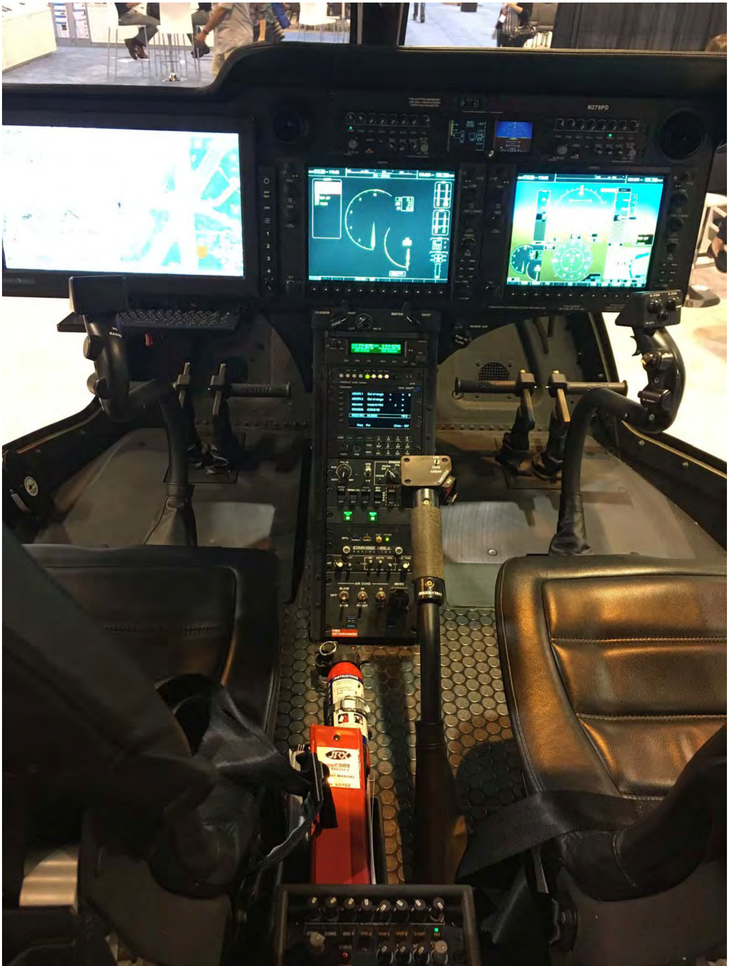
Bell brought along one of the first in-service JetRanger X in law enforcement configuration. This example is in service as N279PD/ c/n 65102 with Sacramento Police Dept., [SPD] in California. When it returned to police service after the show it was based out of McClellan Airport in California, with the Sacramento Police Department (SPD) Air Operations team [see also page 11]