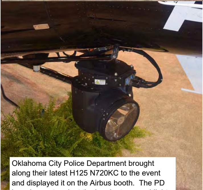
Oklahoma City Police Department brought along their latest H125 N720KC to the event and displayed it on the Airbus booth. The PD has chosen to adopt the Luminator searchlight and so far have them for three aircraft. The searchlight controller below is fitted alongside the TFOs seat in the H125.