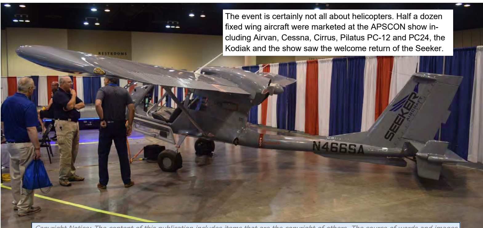
The event is certainly not all about helicopters. Half a dozen fixed wing aircraft were marketed at the APSCON show including Airvan, Cessna, Cirrus, Pilatus PC-12 and PC24, the Kodiak and the show saw the welcome return of the Seeker.

Copyright Notice: The content of this publication includes items that are the copyright of others. The source of words and images will usually be indicated together with the source of additional information that seeks to enhance the original information.